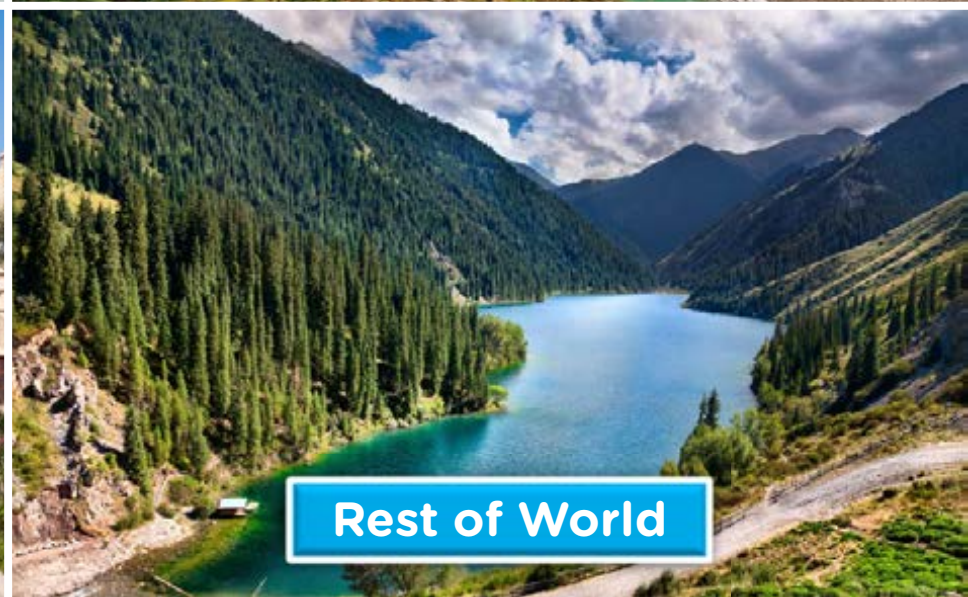
Rest of World